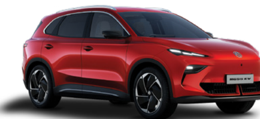
● DYNAMIC RED METALLIC PAINT*