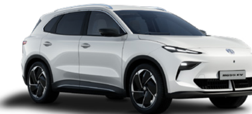
○ ARCTIC WHITE SOLID PAINT