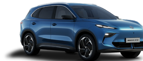
● PICCADILLY BLUE METALLIC PAINT*