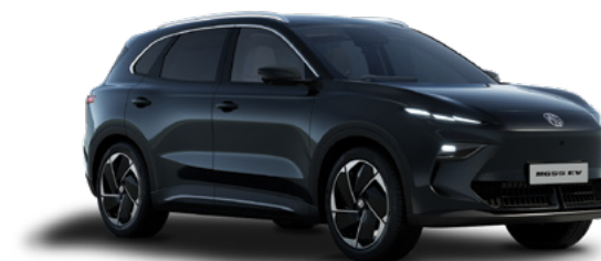
● BLACK PEARL METALLIC PAINT*