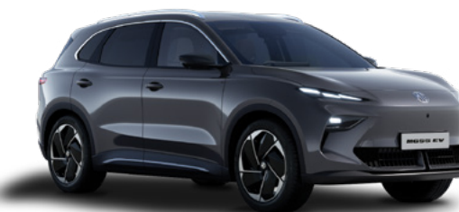
● CAMDEN GREY METALLIC PAINT*